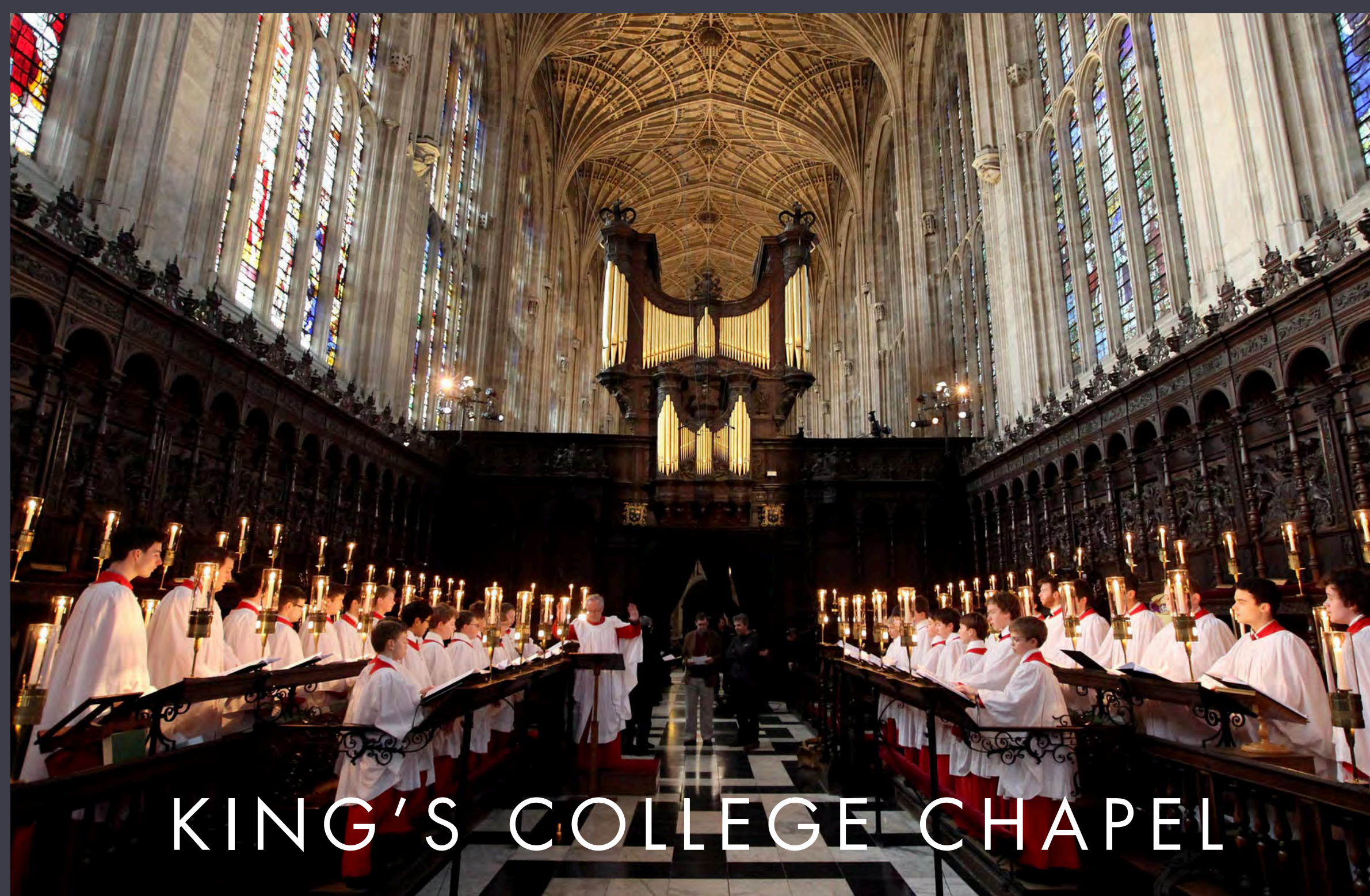
KING'S COLLEGE CHAPEL

King's College Chapel is a sight to behold in winter. Adorned with festive decorations, the chapel exudes a serene and enchanting atmosphere. Visitors can marvel the intricate fan vaulting, stunning stained glass windows, and experience the ethereal sound of the renowned King's College Chior during their special Christmas performances. A visit to King's College Chapel in winter offers a unique opportunity to witness this architectural masterpiece in a truly magical setting.