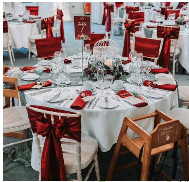
Daniel Goodyear Photography